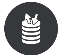
Seamless & Secure Data Flow

Lantronix IoT gateways are available in both embedded and external form factors. These two options allow customers to design-in gateway functionality for next-generation connected devices, as well as bolt-on connectivity for legacy systems using the Lantronix IoT external device gateways.