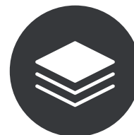
Host Ecosystem Apps & Services