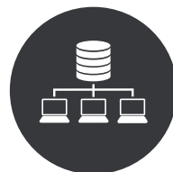
Production-ready & Secure Software Stack