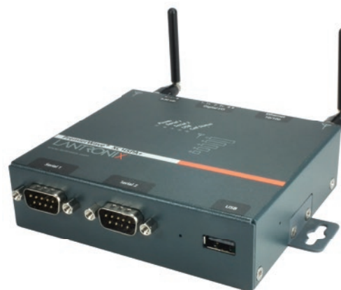
Mounting Bracket (one on each side)

Slide the SIM holder to the lock position (in direction of the LOCK arrow). Replace the cover.