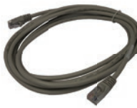
RJ-45 Ethernet Straight Cat5 Cable