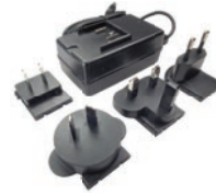
Power Supply (Actual power supply may differ from that depicted here.)