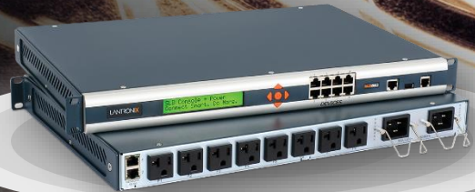
SLB™ Branch Office Manager