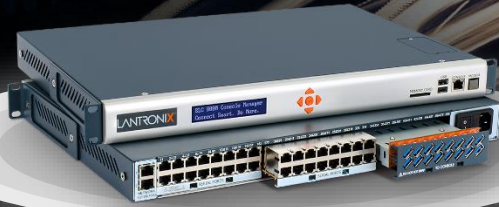
SLC™ 8000 Advanced Console Manager