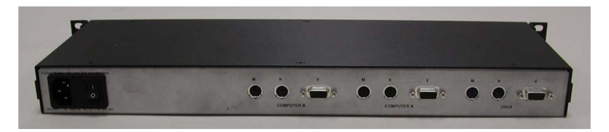
KVM 2-Port, Rear View, showing connections

All connections are made with industry-standard mouse, keyboard and video connectors found in conventional PC computer equipment. The necessary PS/2 and Video cables are ordered and shipped with the KVM 2-Port.