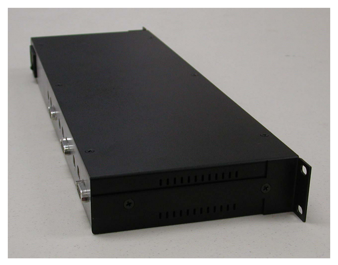
KVM 2-Port, Side View, showing removable Rack Mount bracket