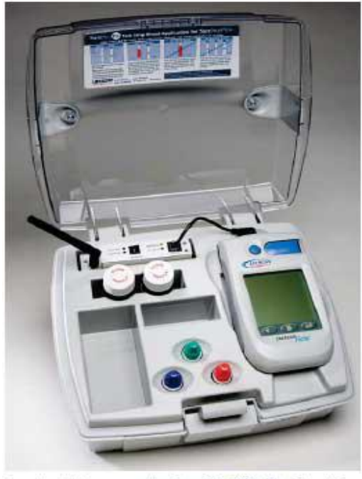
A custom battery-powered version of the WiBox<sup>*</sup> is integrated into the LifeScan OneTouch<sup>*</sup> DataLink<sup>*</sup> Unit.