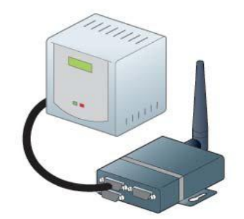
External Device Servers Web-enable your products. Speed time-to-market. Connect existing equipment to Ethernet and the Web.