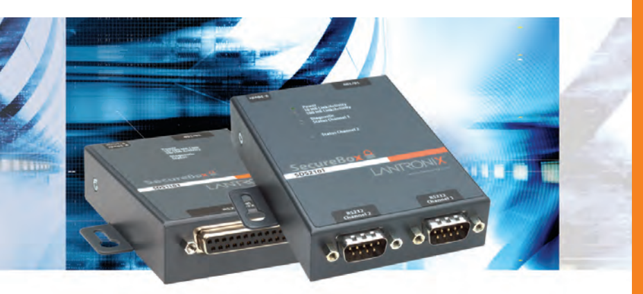
SecureBox SDS1101 & SDS2101